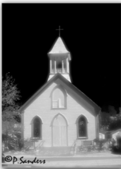
Peggy Sanders - B&W -categ