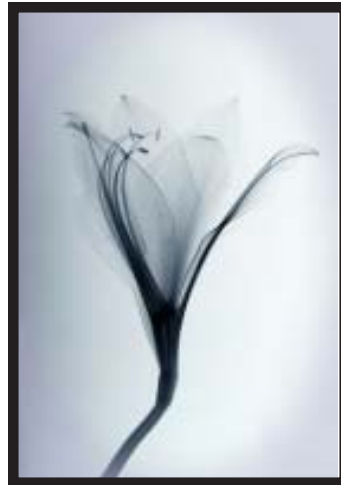
Hal Endlich -open