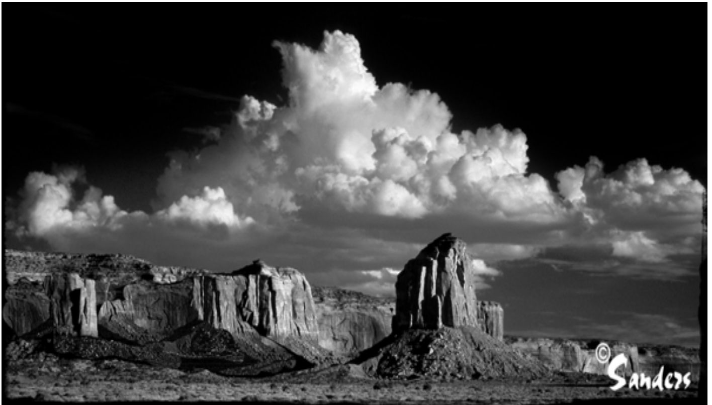
Jerry Sanders B&W - categ