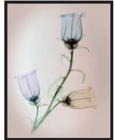
Hal Endlich - open