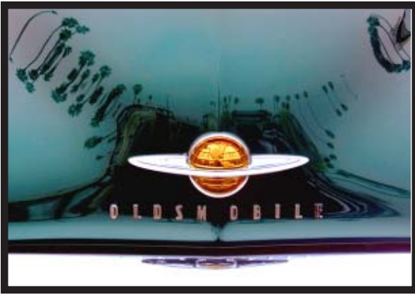
Roy Allen - Old Olds - open