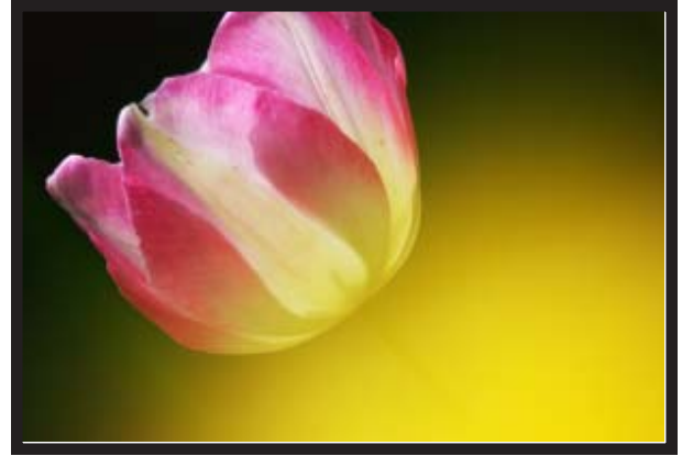
Roy Allen - Floating Tulip -open