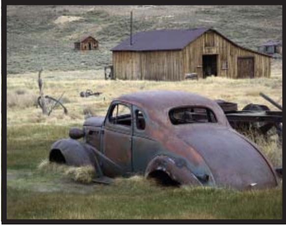
Hal Endlich - Bodie--open