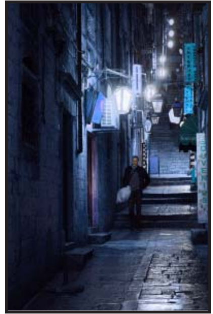
Audrey Mead --Dubrovnik Sm St. - Assigned