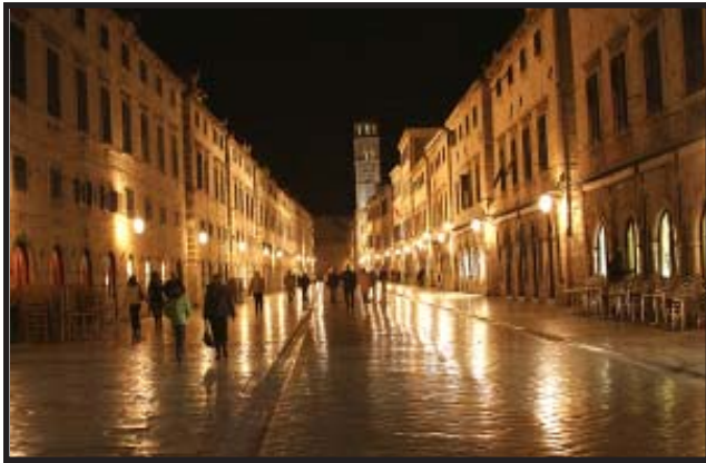
Audrey Mead--Dubrovnik St--Assigned