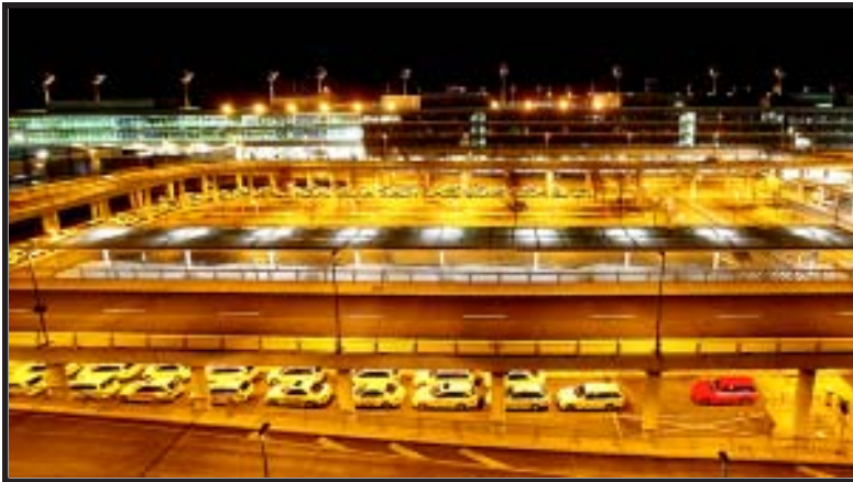
Audrey Mead - Taxi Row in Munich - Assigned