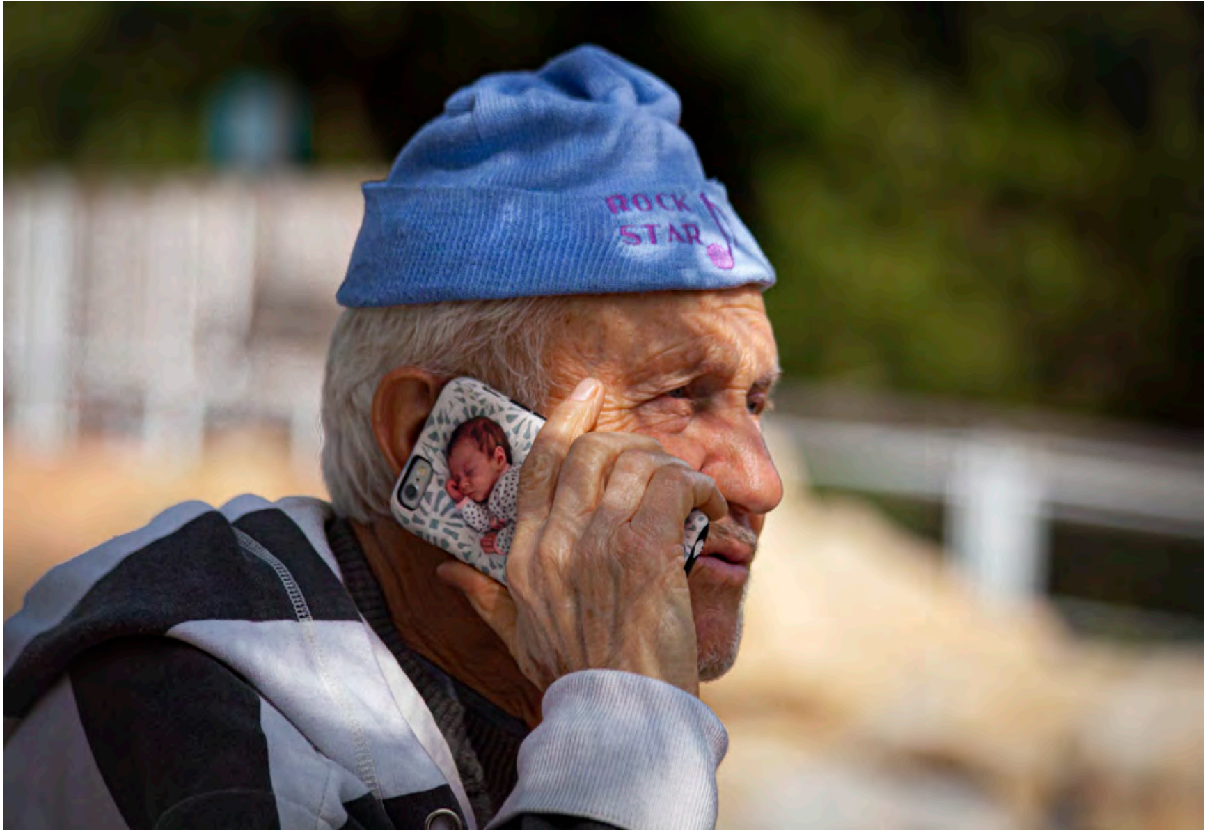
Street Portrait Candid