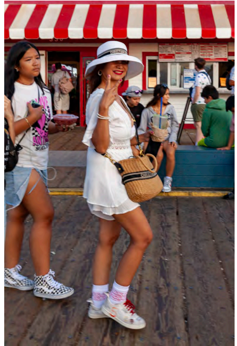
Street Portrait Posed or “Posey”