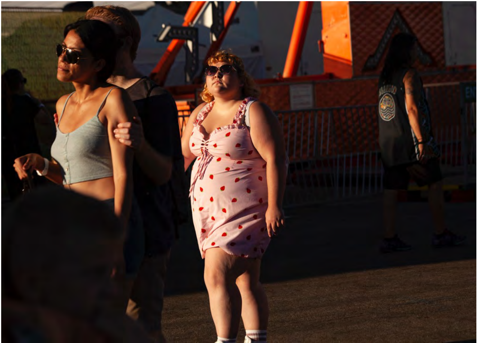
Light and time of day